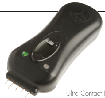
Ultra Contact Reader